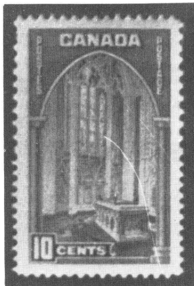
Ten cents :— The Memorial Chamber, representing Ontario Province.

In this chamber, embodied in stone, is the spirit of the Canadian people. The Chamber beneath the Peace Tower of the Parliament Buildings, was opened officially on the 11th November, 1928. The walls and ceilings are made from stone presented by the people of France, as is the marble of the columns. The floor is made up of various types of stone from the principal battle areas in which Canadians fought, such as Mons, Ypres, Mount Sorrel, Somme, Vimy Ridge, Hill 70, Arras and Amiens. The black marble of the altar steps was a gift from the people of Belgium.