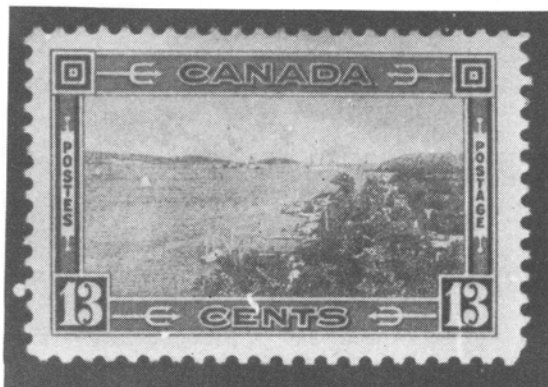
Thirteen cents :- Halifax Harbour, representing the Maritime Provinces.