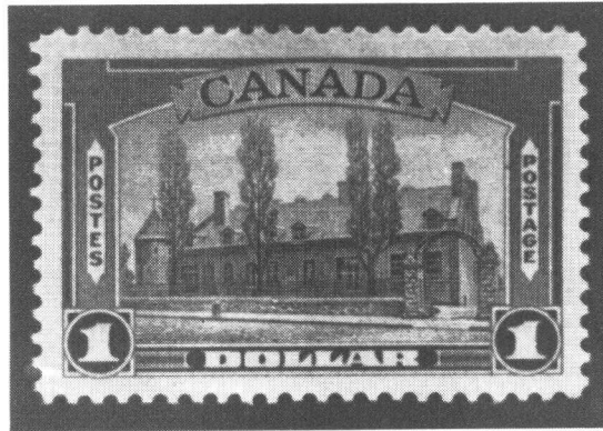
One Dollar :– Chateau de Ramezay, Montreal, representing Quebec Province.

This natural harbour was discovered by Captain George Vancouver in 1792 and is Canada's major west coast port. Located in Burrard Inlet, it has easy access to the Pacific Ocean through the Straits of Georgia and Juan de Fuca. The harbour is normally ice free and open to navigation all the year round.