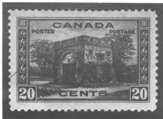
Twenty cents :- Upper Fort Garry Gate, Winnipeg, representing the Prairie provinces of Alberta, Manitoba and Saskatchewan.

Now surrounded by the City of Winnipeg, and more or less overshadowed by the massive Fort Garry Hotel, this gate is a relic of the old pioneer days when the fur traders used to bring their furs into the town, from the great trapping areas around the Great Lakes and Hudson Bay. The actual gate is a remnant of a complete fur-trading fort.