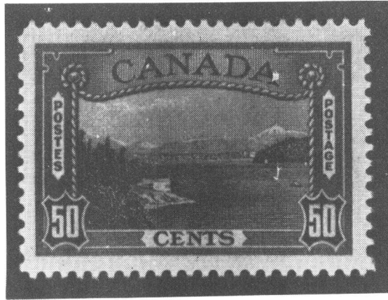
Fifty cents :– Vancouver Harbour Entrance, representing British Columbia.

This natural harbour was discovered by Captain George Vancouver in 1792 and is Canada's major west coast port. Located in Burrard Inlet, it has easy access to the Pacific Ocean through the Straits of Georgia and Juan de Fuca. The harbour is normally ice free and open to navigation all the year round.