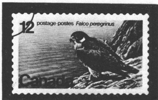
Plate inscriptions carry the titles of the artwork, the name of the designer and the name of the printer.

The stamps were all printed in five-colour lithography on paper coated on one side. P.V.A. gum was used throughout the printing and all stamps bear the general tagging.