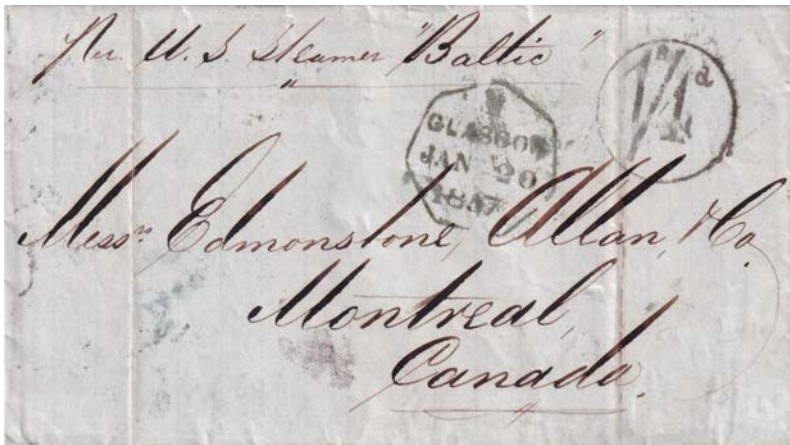
Figure 6: 'Baltic'. Glasgow, Scotland, to Montreal, Canada East, 20th January 1857. A letter posted unpaid 'Baltic' without a British claim. It was charged one shilling and fourpence, the Montreal office using a rate handstamp by this time with its original 'Cy.' (Currency) designation either missing or removed. This is the last letter recorded carried to Canada by the Collins Line. 'Baltic' was damaged during westbound leg of voyage, and required extensive repairs on return to New York, did not sail again until 16th August 1857.