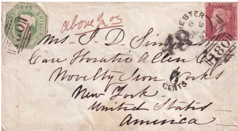
Figure 7: 'Adriatic'. Chester, England, to New York, via Liverpool, 6th December 1857. A letter from Chester for New York prepaid one shilling and a penny (with a shilling cut-to-shape and a Penny Red) marked 'Over 1/2 oz.' the prepayment disregarded and charged double as a one-ounce letter. Carried by 'Adriatic', on the return leg of her maiden and only voyage for Collins Line, sailed from Liverpool on 9th December for New York on 21st December 1857.

By the end of 1857 Collins' service, despite further charters, was failing. The Atlantic gales were taking their toll, and both 'Atlantic' and 'Baltic' suffered delays from equipment failures. In the autumn of 1857 Collins took delivery of his fifth ship 'Adriatic', (Figure 7.) This vessel, long delayed by lack of funds, made only one round voyage before Collins' mail contracts were terminated and the line ceased operation. The final voyage of the Collins Line was made by 'Baltic' early in 1858. Not one cent, by way of dividends, was ever paid to the investors in the company.