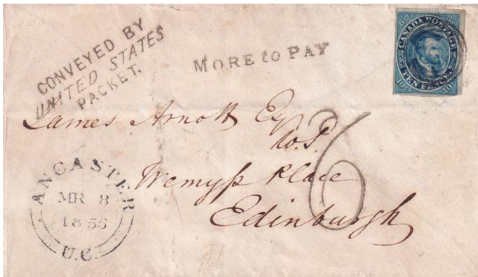
Figure 2: Ancaster, C.W., to Edinburgh, Scotland, 8th March 1856, prepaid tenpence Currency (as though for a British packet) but sent with 'MORE TO PAY' to New York for the first packet to sail 'Baltic' out of New York on 15th March for Liverpool on 28th March 1856, charged sixpence (Sterling) and marked with 'CONVEYED BY / UNITED STATES / PACKET' in black on obverse. The last recorded use of this handstamp.