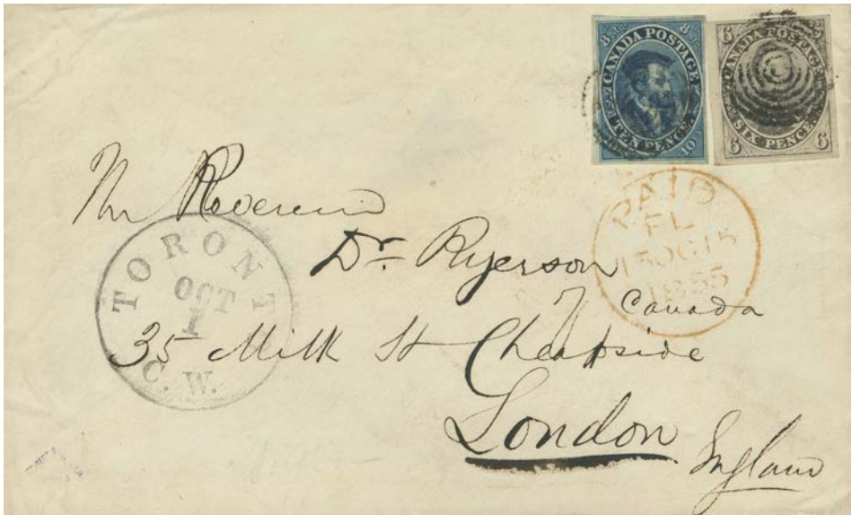
Figure 3: A letter from Toronto posted on 1st October 1855 prepaid one shilling and fourpence (6d +10d currency) and passed to New York for ‘ Baltic ’, sailing on 3rd October for Liverpool on 14th October 1855. The letter arrived in London on 15th October 1855, marked ‘ PAID ’.

By the end of 1855 the Cunard Line began to be relieved of its Crimean War transport commitments and resumed its preferred Wednesday New York sailings; the Collins Line reverted to the less popular Saturdays. Worse was to follow when ‘ Pacific ’, returning from Liverpool on her first voyage in 1856, disappeared without trace, with her entire complement of almost 200 passengers and crew, leaving Collins with only three vessels to maintain his service. There is, as far as I know, only one clue to the fate of ‘ Pacific ’ – a message from a passenger enclosed in a bottle and washed ashore in Scotland some time after the sinking. If any reader knows of its present location I would dearly like to see it!