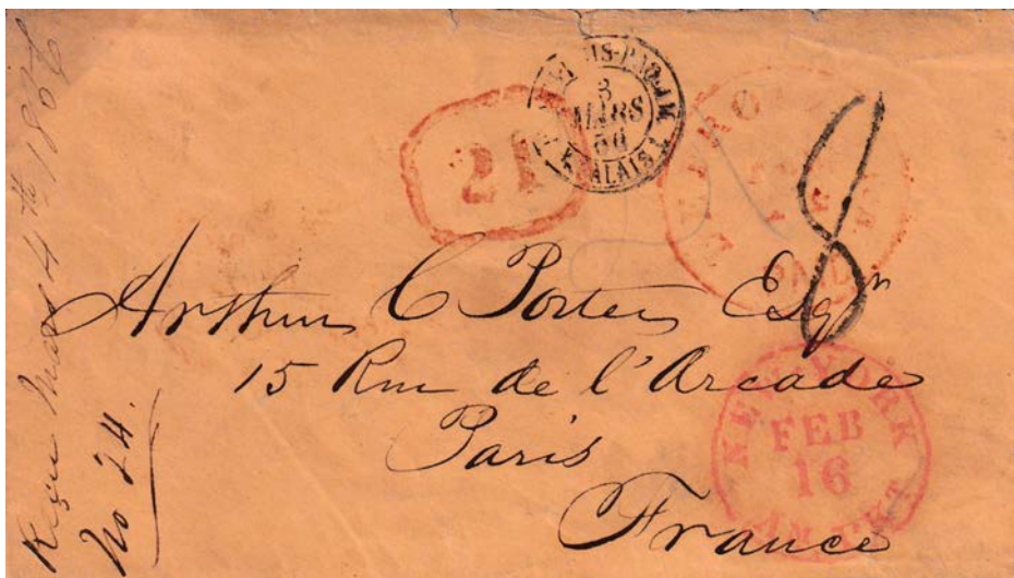
Figure 4: 'Quaker City'. Detroit to Paris, 13th February 1856. The envelope of a letter from Detroit with red octagonal '21' (cents), through New York 16th February to Liverpool thence to London and arriving in Calais on 3rd March 1856. Charged '8' décimes in Paris.