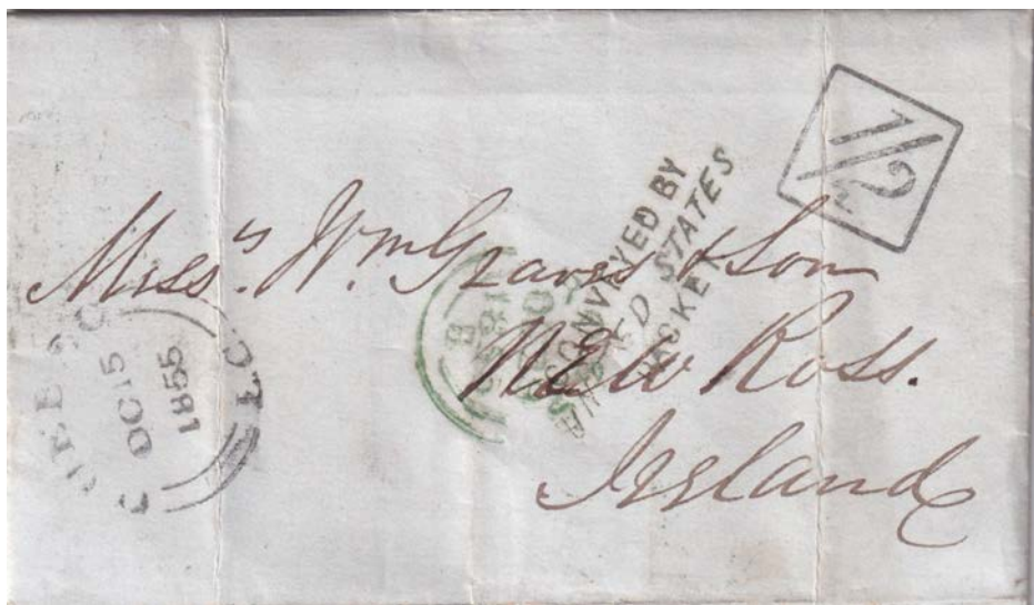
Figure 1: A letter from Quebec, L.C., to New Ross Ireland, posted unpaid on 15th October 1855, with the rare Quebec '1/2' (Sterling) postage due handstamp. It was sent to New York for the first packet to sail, 'Pacific', out of New York on 17th October for Liverpool on 28th October 1855, marked with 'CONVEYED BY / UNITED STATES / PACKET' in grey on obverse.